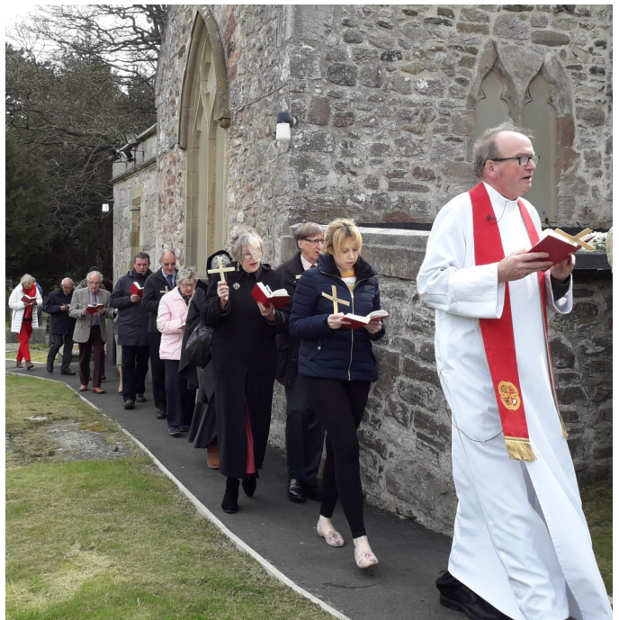
Above: "All glory, laud and honour" The congregation at St Hilary's striding out in their Palm Sunday procession round the church.

If we can take these seriously we really can nourish the green shoots of the growing church. I pray that the power of Christ's resurrection will invigorate us all.