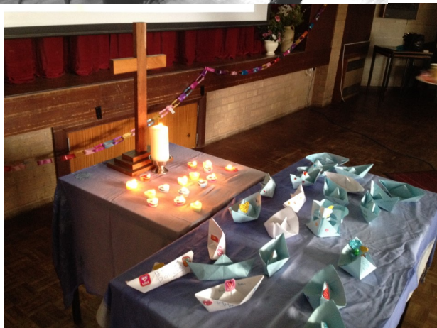
Above: Mothering Sunday Digin - singing about the size of God's love for us, and a veritable fleet of prayer boats carrying prayers of those present.

This Christian Aid Week, together, we can make childbirth safe for mums and babies. Through our gifts and prayers, we can help give the world's poorest mums a chance to live.