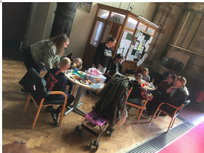
Above: Sixteen teams took part in the Ysgol Bodafon treasure hunt around Craig y Don, and enjoyed suitable refreshment after walking around the area in search of clues.