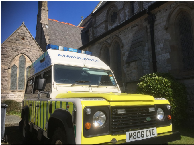
Above: Spotted at St Paul's..... But don't worry, everyone is fine! The Llandudno branch of St John Ambulance is now based in St Paul's church hall and meets there for training each Monday. It means the group's ambulance is also a feature parked in the churchyard.

Work like you don't need the money Love like you've never been hurt Dance like nobody's looking Sing like nobody's listening Live like it's heaven on earth